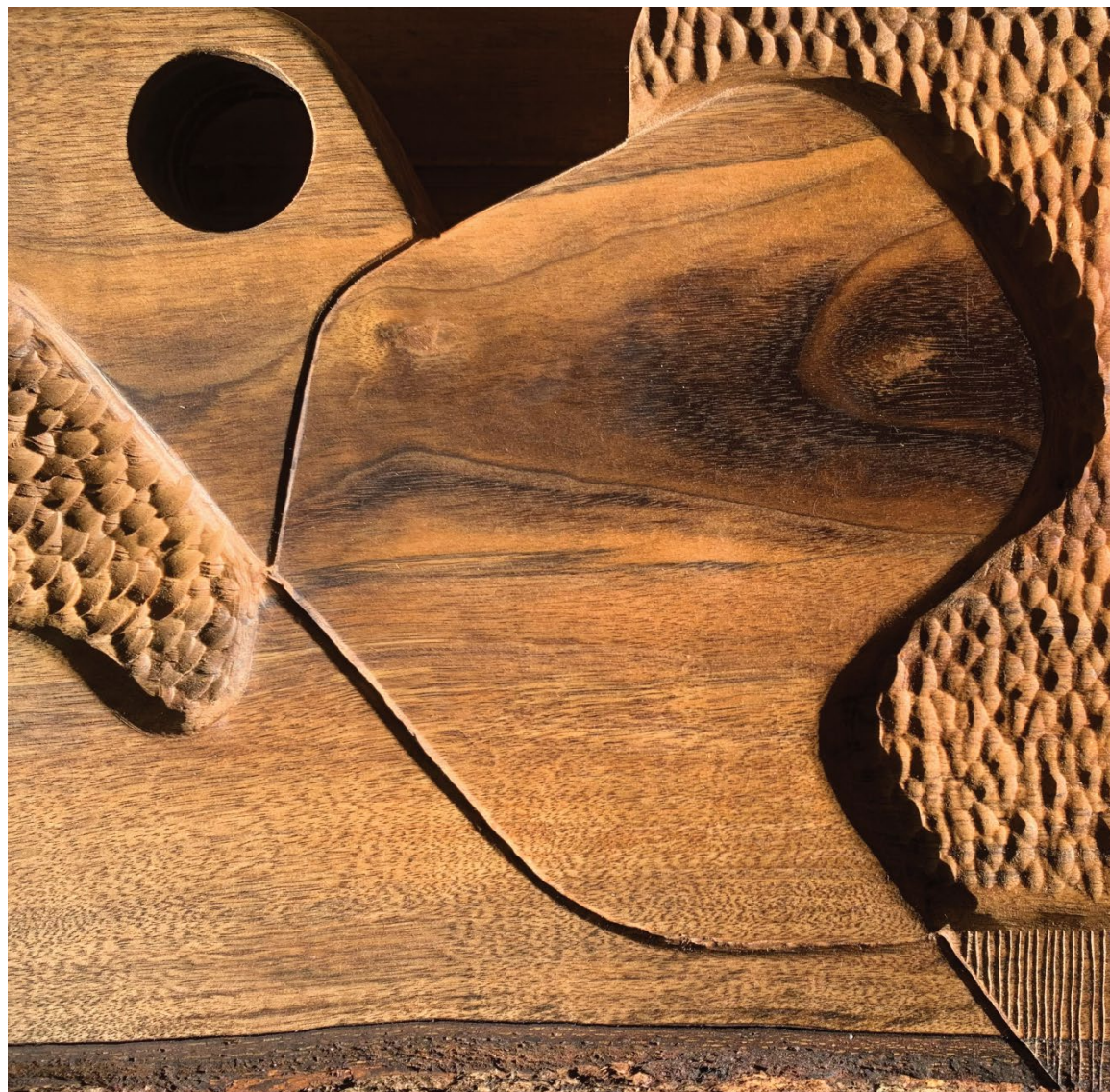
VERIDIANA GOULART Cordilheira (Mountain range) DETAIL