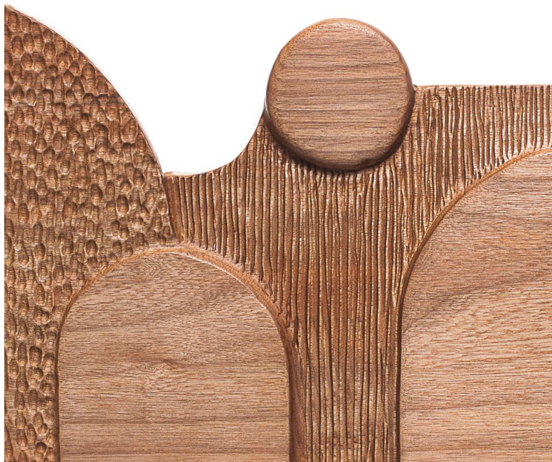
VERIDIANA GOULART Psitacídeo (Parrot) DETAIL