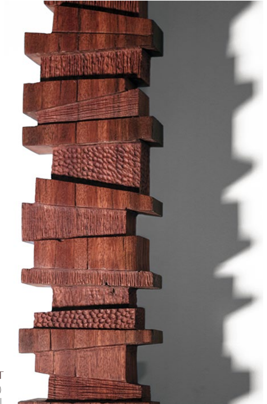
VERIDIANA GOULART Tempo leve leva tempo (Lightweight times take time) DETAIL